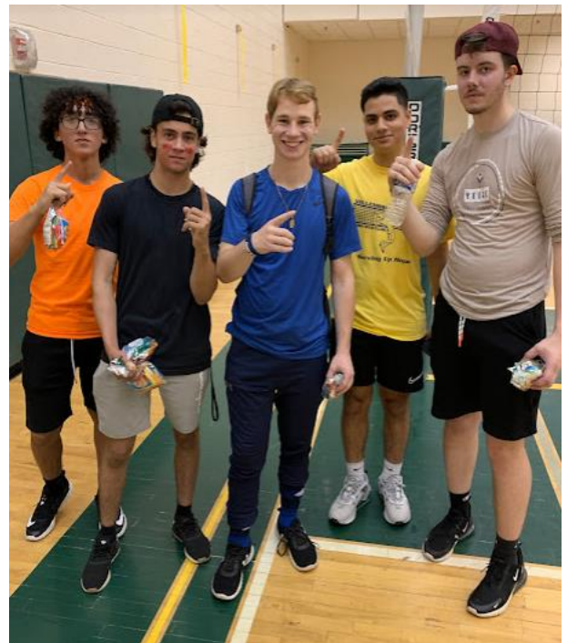
2 nd Place - Skittles