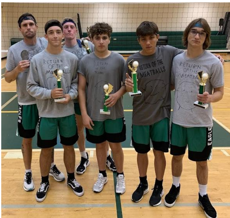
1 st Place – Return of the Meatballs